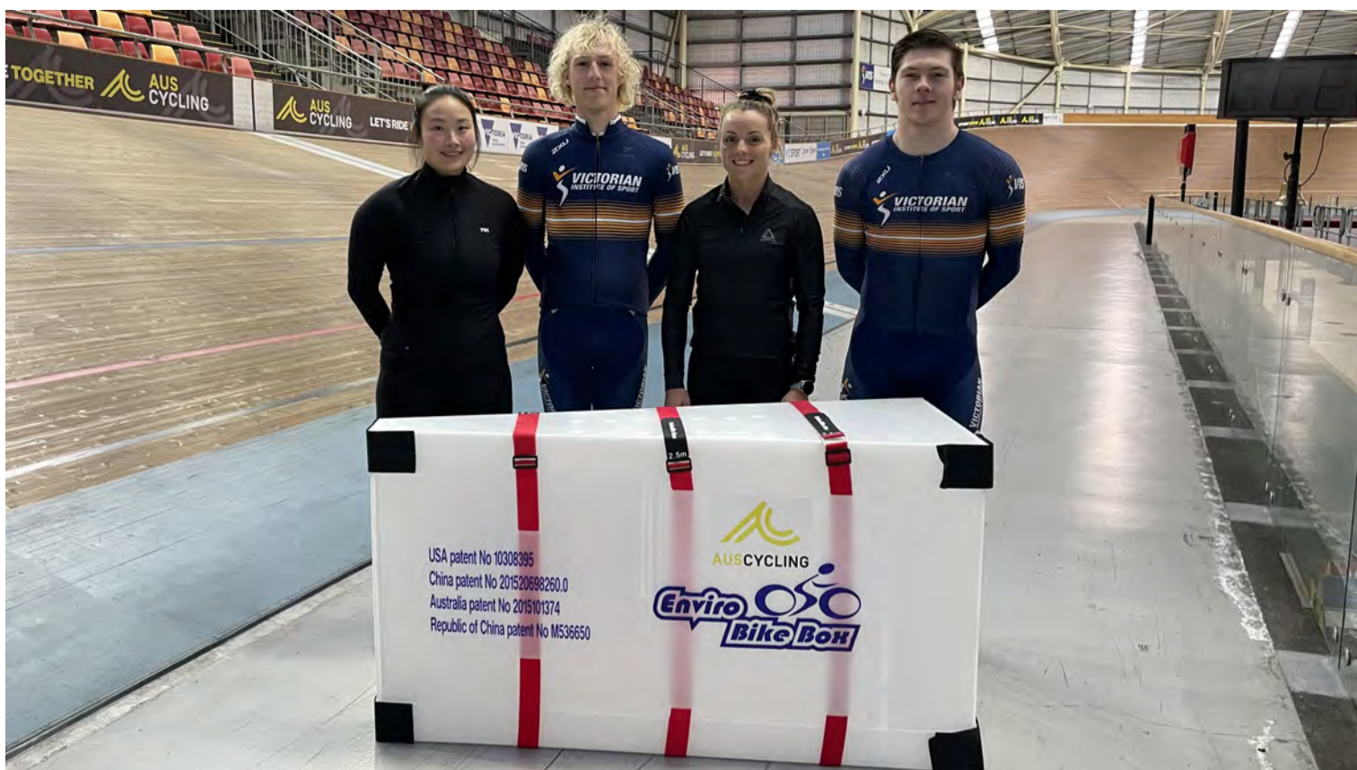
Australian Cyclists with an AusCycling Enviro Bike Box

Enviro Bike Box is a family-owned business that has been an important partner of Australian cycling since 2012 and will remain committed to AusCycling until at least 2025.